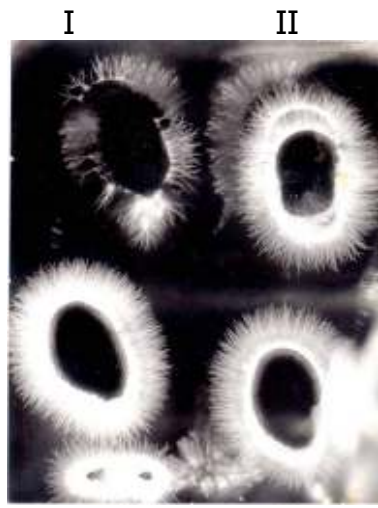
III 3 IV