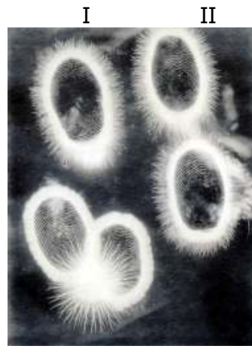
III 4 IV