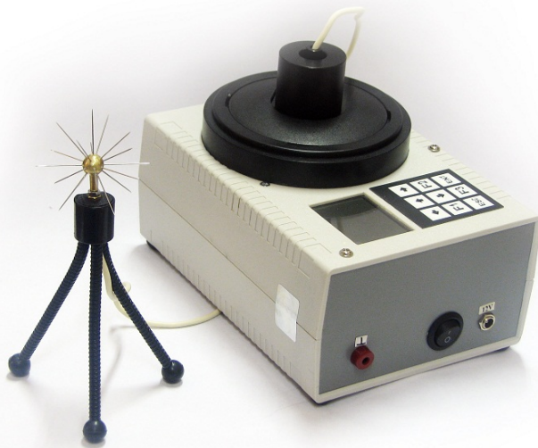
GDV Camera Compact and GDV Eco-tester